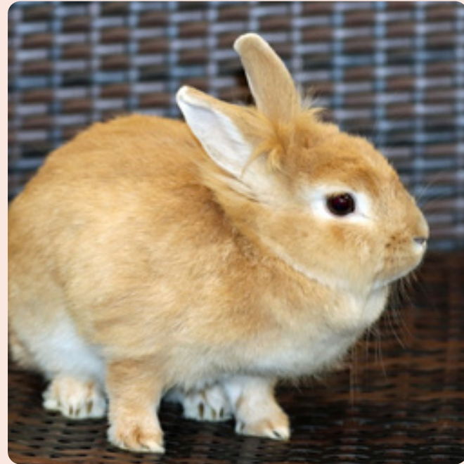
Lulu - Lionhead Rabbit

Overall, The Texas Zoo is a great place to visit. As an experienced animal keeper and exotic veterinary technician, I can confidently say the staff's dedication shines through. I highly recommend checking it out and supporting their mission!