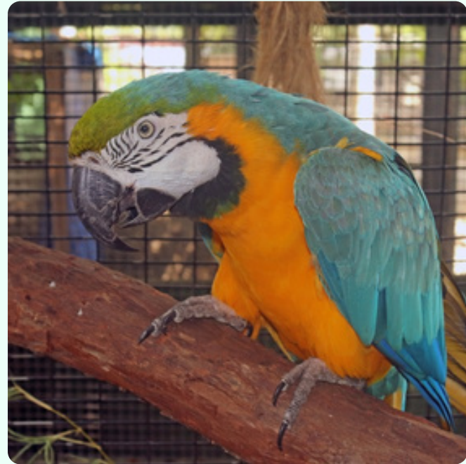
Bubba – Blue and Gold Macaw